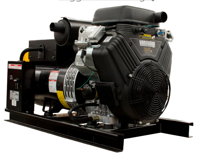
B & S Commercial Vanguard Engine